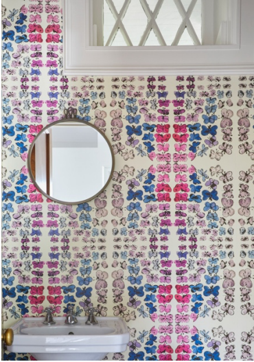
Maiden & Moonflower wallpaper by Kiki Smith (Foyer Powder Room)