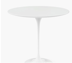
Formal Living Room