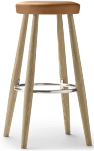
Kitchen Bar Stools

angles, creating a dynamic appearance from every viewpoint. Offered in a selection of wood finishes, the Monument table can be customized to suit a variety of interior aesthetics. This piece embodies Artisan's commitment to innovative design and exceptional craftsmanship, making it a bold and unforgettable addition to any environment.