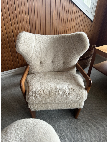
Primary Sitting Room