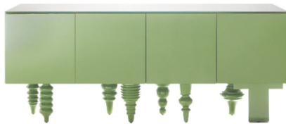
Formal Dining Breakfront

Even decades after it was first produced, the CH56/CH58 Stool from Carl Hansen and Son is still an ideal fit for modern kitchens, bars and restaurants. It creates an inviting atmosphere for social encounters with its soft, organic shape and comfortable leather-upholstered seat. Lightweight and easy to move around any space, the accenting metal ring ensures both stability and comfort for resting your feet, while the legs have been crafted to be thicker where they need to support the construction most.