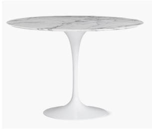
Nook off Foyer